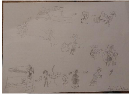
E created this detailed ArtsMap

N is taking Explore, their interpretation of the ArtsMap concept was detailed