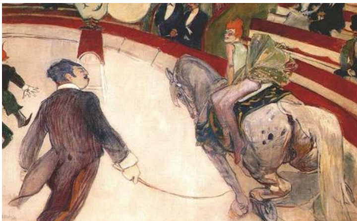
Equestrienne (At the Cirque Fernando)