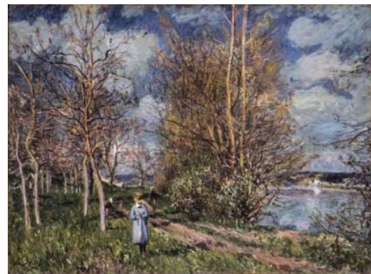
The Small Meadows in Spring