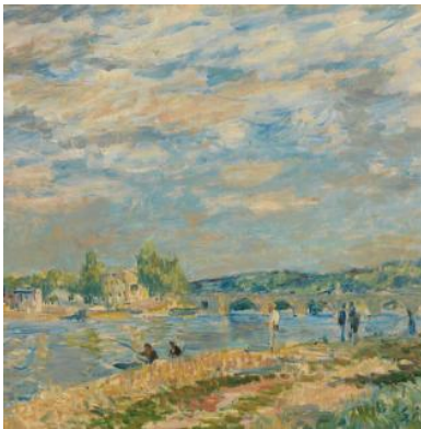
The Bridge at Sèvres