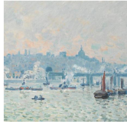
View of the Thames: Charing Cross Bridge