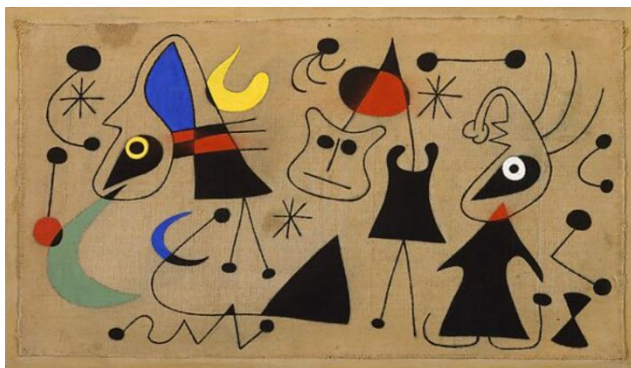
Woman and birds at sunrise