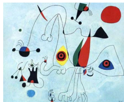
Woman and birds in the night