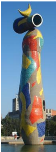
Dona i Ocel