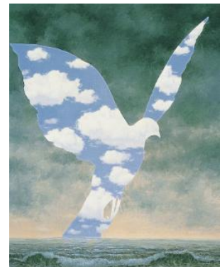
The Large family