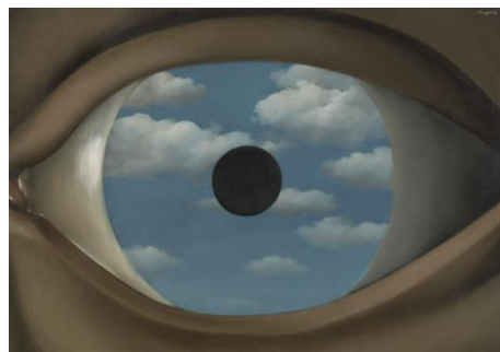
The false mirror