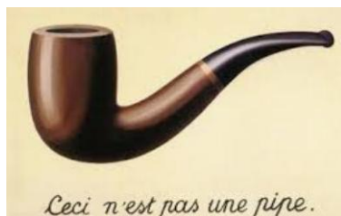
The Treachery of Images