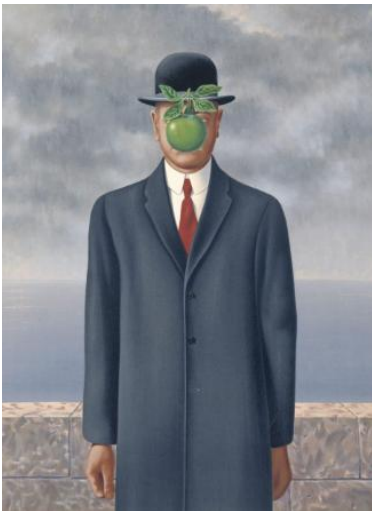
The son of man