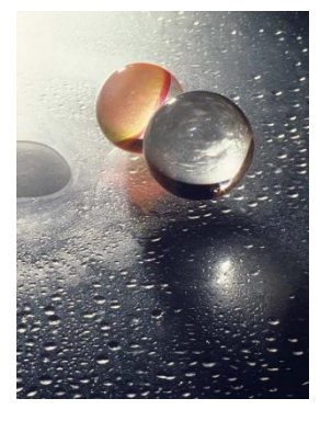
Liquid Reflections: A sculpture that uses light and water to create moving reflections.

Conjunction of Opposites: Two tall figures that light up and move, representing different sides of femininity.