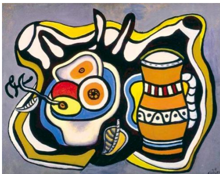
The Orange Vase