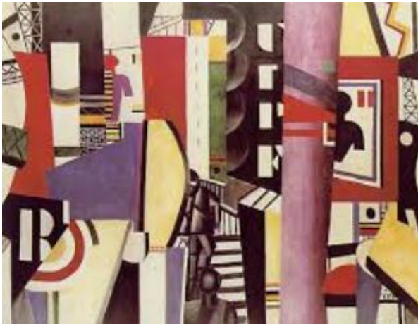
The City (1919) – A busy painting full of buildings, lights, and movement.

Here are some of the amazing pictures he made: