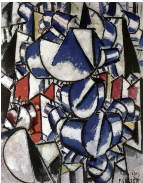
Contrast of Forms (1913) – Just shapes and colours—super modern!