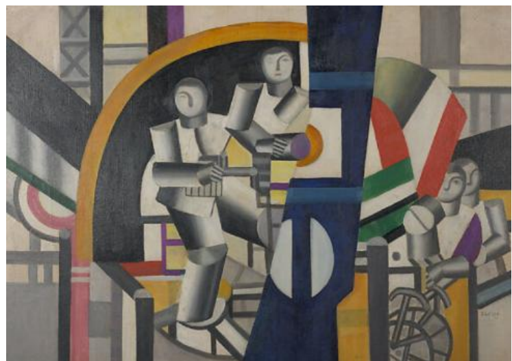
The Builders (1950) – Strong workers building something big.