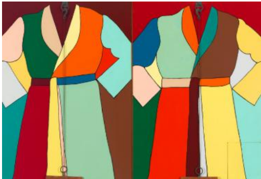
Double Isometric Self-Portrait