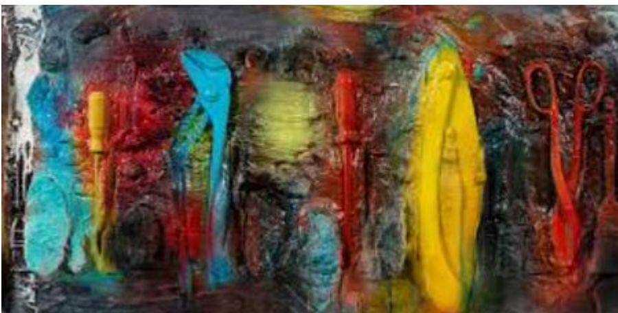
Twelve colourful tools