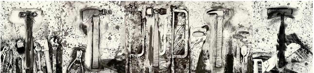
The Five Hammer Etudes