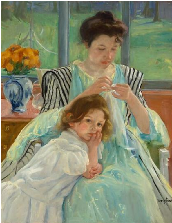
Young Mother Sewing