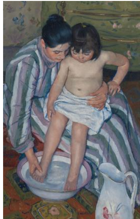
The child's bath