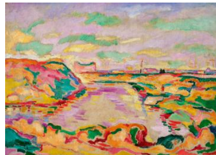
Landscape near Antwerp