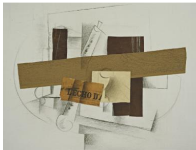
Still life with Tenora