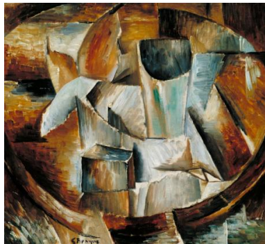
Glass on a table