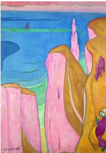
Epoque de Pont Aven